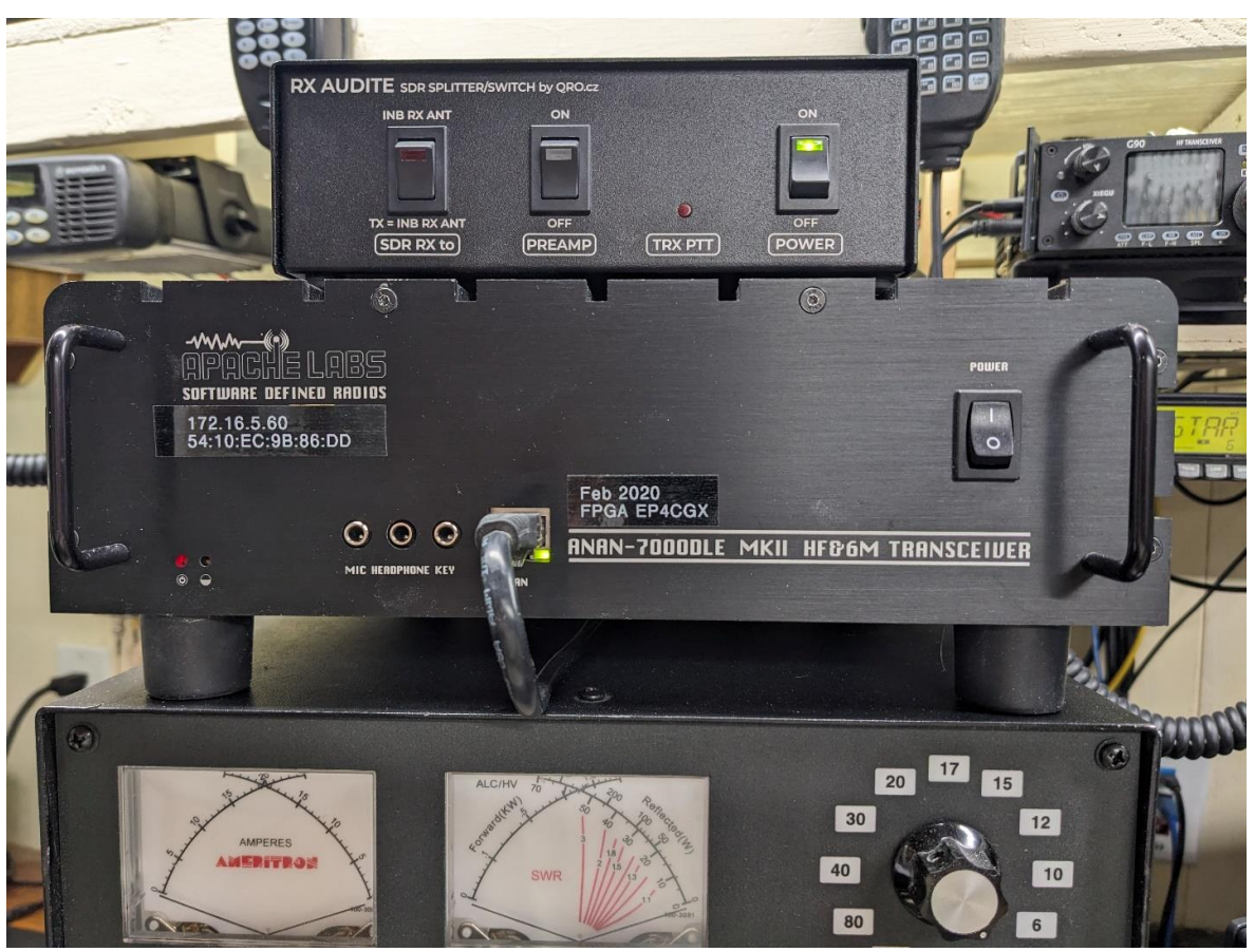
Here is the RX Audite in service in my shack under my Apache Labs ANAN 7000.

I did not feel the need of going into great detail here in my review because the provided online manual and QST review are thorough and comprehensive. The manual has plenty of block diagrams showing various connections and internal signal paths.