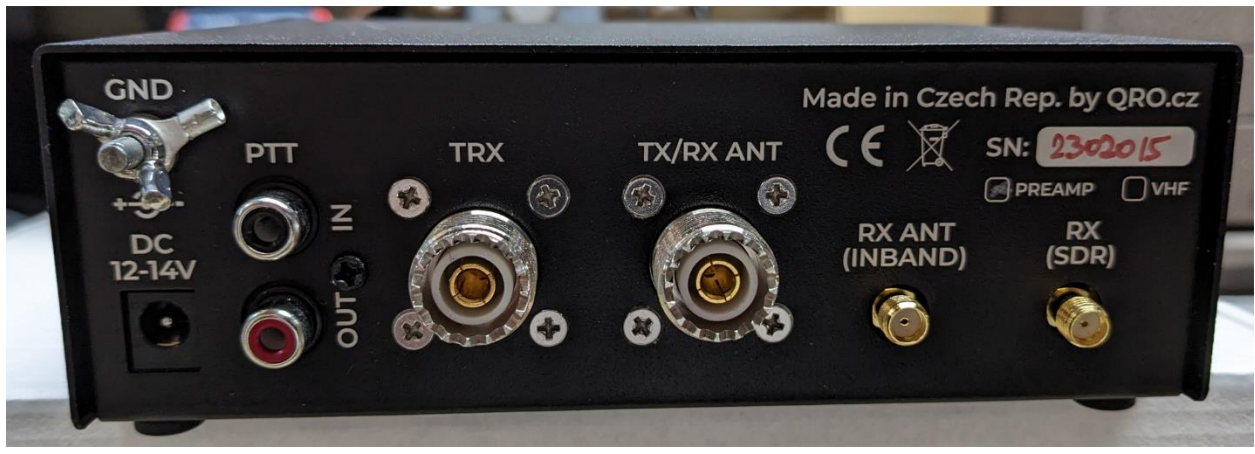
On the rear panel you will find several jacks.

GND. This is a place to connect your station ground wire.